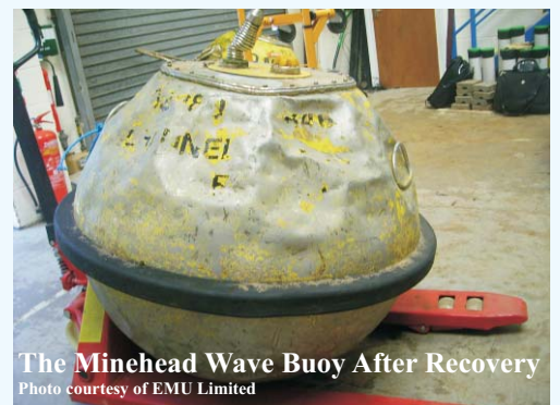
The Minehead Wave Buoy After Recovery

A replacement for the Minehead wave buoy (which was recovered from a field, badly damaged) has been deployed. The Torbay wave buoy was damaged and out of use between September and November but has now been redeployed.